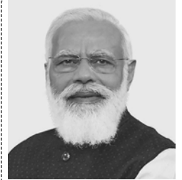
Prime Minister Narendra Modi EMBASSY OF INDIA

ity and maritime transport pillar of India's Indo-Pacific Oceans Initiative, which is an open, inclusive, nontreaty-based global plan for mitigating challenges, especially in the maritime domain. Partner countries are committed to taking forward the vision of "the Quad" in key and strategic areas, including vaccines, climate change, critical and emerging technologies, quality infrastructure development, space, cyber, education and people-to-people cooperation for a secure, peaceful, prosperous and stable Indo-Pacific.