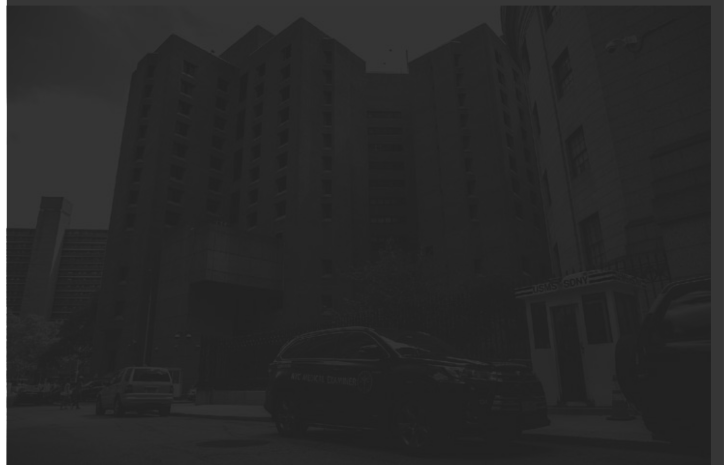
A medical examiner vehicle is seen at the Metropolitan Correctional Center, where Jeffrey Epstein was found dead, on Saturday.