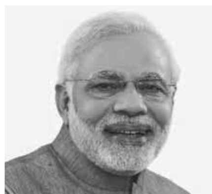
Prime Minister of India Narendra Modi

for the decade. This includes a pollution-free India; digitization; space exploration; physical and social infrastructure; water management; the "blue economy" (ocean management); self-sufficiency and export of agricultural commodities; enhancing people-to-people partnership; minimum government, maximum governance; a healthy society and well-nourished women and children; safety of citizens; emphasis on micro, small and medium enterprises as well as startups, defense manufacturing, automobiles, electronics, fabrication facilities and batteries; and medical devices under the "Make in India" program. Startup ecosystems and "Skill India" initiatives are playing a significant role in developing India's human resources.