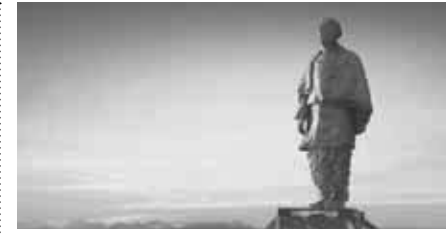
The Statue of Unity, a monument dedicated to Indian founding father Sardar Patel, is located in the state of Gujarat. [CIJ]

Rashtriya Ekta Diwas (National Unity Day) was inaugurated by Prime Minister Narendra Modi in 2014. It is to be celebrated on Oct. 31 as an annual commemoration of Patel's birthday. The official statement by the Indian Home Ministry cites that National Unity Day will pro-