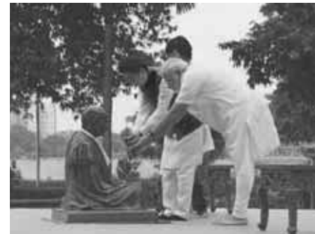
Prime Minister Shinzo Abe, his wife Akie and Prime Minister Narendra Modi offer flowers to a statue of Mahatma Gandhi in Sabarmati Ashram in September 2017. [CIJ]

"Economic development in our country is important, but more than anything else, human dignity is supreme. The government of India has decided to launch