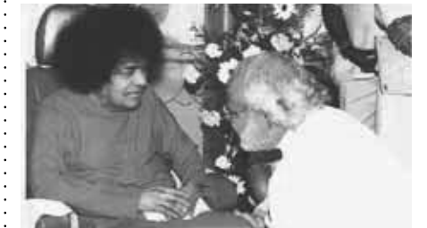
Prime Minister Narendra Modi meets Sri Sathya Sai Baba, India's late spiritual leader, in Chennai on Nov. 7, 2003.