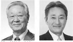
Hiroaki Nakanishi Kazuo Hirai

Japan and India enjoy a long-standing diplomatic relationship and in recent times our two nations have built close, mutually beneficial relations through reciprocal diplomatic visits by our state leaders. Particularly on the economic front, the number of Japanese companies has reached 1,300, with 4,800