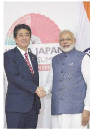
Prime Minister Shinzo Abe and Prime Minister Narendra Modi hold Japan-India Annual Summit talks in India in September.

sociation marks the 115th year since it was established in 1903. We are determined to fulfill our mission to serve our two nations.