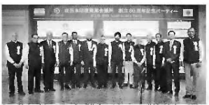
The Indian Chamber of Commerce in Japan holds a reception in September 2017 to mark the 80th anniversary of its foundation.

Republic Day, a day of celebrations and excitement, reverberates throughout India and the diaspora community in the world. It is the day on which the Constitution of India came into effect, changing forever the country's status as a dominion of the British regime. Speeches and cultural dances are held and no official work is done on this day, as it is