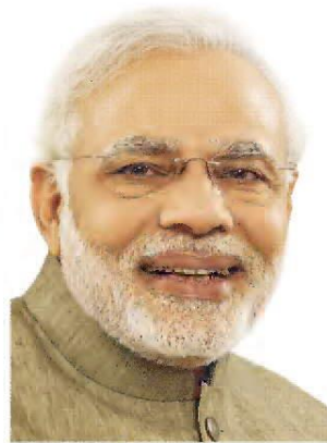
Prime Minister of India H.E. Narendra Modi