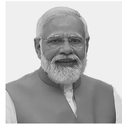
Prime Minister Narendra Modi EMBASSY OF INDIA

health care, manufacturing, micro, small and midsize enterprises, and startups. Collaboration in critical minerals and frontier technologies for 5G and beyond, big data, quantum computing, blockchain, Internet of Things, data security, networks, data transport systems and more are essential to creating resilient supply chains. India is also emerging as a top source of skilled human