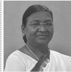
President Droupadi Murmu

the cornerstone of our bilateral relations and has yet to reach its potential. Japan is the fifth-largest investor in India. In the previous financial year, bilateral trade exceeded $20.5 billion, the highest so far, despite disruptions from the COVID-19 pandemic. The appetite of Japanese companies has increased due to the Indian government's various investment support measures, including the Production Linked Incentive scheme, the National Single Window System, PM Gati Shakti, the National Infrastructure Pipeline and taxation and labor law reforms. "Co-innovate," "co-create" and "co-produce" are new potential mantras for future collaboration. Unmet potential exists in areas such as food security, education, the environment, renewable and clean energy (hydrogen and ammonia as fuel),