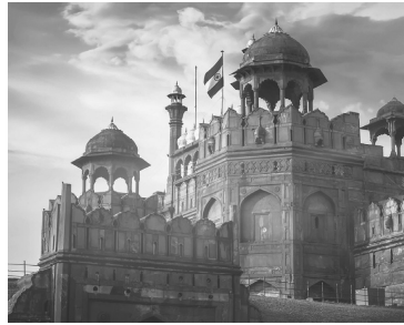
Lahore Gate, Red Fort, Old Delhi INCREDIBLE INDIA

Modi's unwavering faith in his mission, I believe, comes from his deep understanding of the ancient Indian philosophy of Santhana Dharma, and his strong faith in Indian Saints, such as Sri Aurobindo, whose 150th birth anniversary is today.