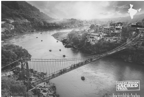
Ram Jhoola bridge spans the Ganges River in Rishikesh, Uttarakhand state. INCREDIBLE INDIA

India is not self-sufficient in energy, spending over 12 lakh crore rupees ($140 million) on importing energy supplies.