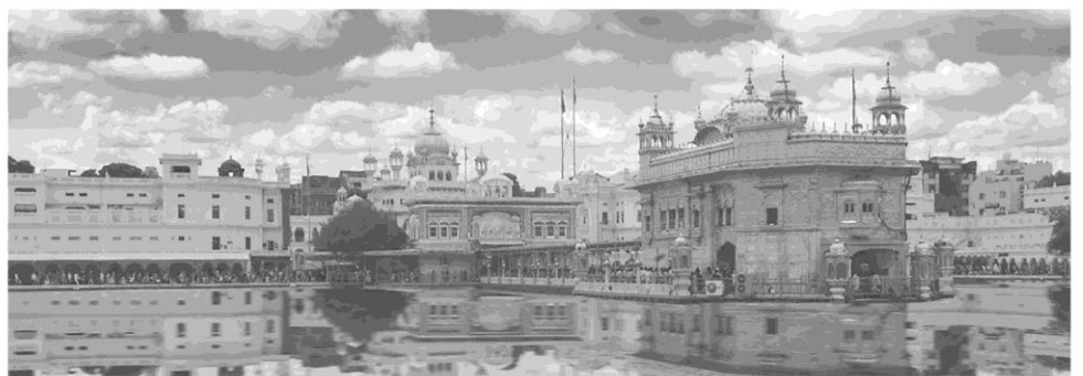
Golden Temple in Amritsar EMBASSY OF INDIA