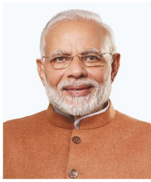
Prime Minister of India Narendra Modi

We have given the highest priority to deliver benefits to poor households, with a package of more than $300 billion. We have also put forward a vision of Atmanirbhar Bharat or Self-Reliant India. The idea of self-reliance does not mean seeking self-centered arrangements or turning the country inward. Its essential aim is to ensure India's position as a key participant in global supply chains. In the post-coronavirus world, we need a new template of globalization based on fairness, equality and humanity. What we need is a reformed multilateralism that reflects contemporary realities and can respond to present-day challenges. India and Japan have long championed