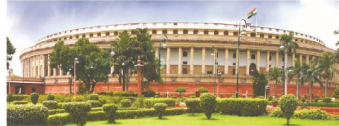
Parliament of India in New Delhi EMBASSY OF INDIA

On this auspicious occasion, the Japan-India Association, with its 117 years of history and wide-ranging network, renews its determination to work for further development of mutual understanding and friendship between Japan and India.