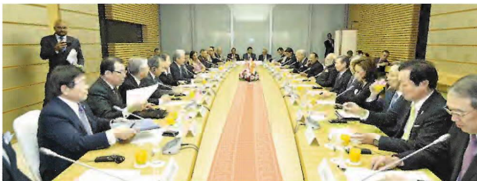
Prime Minister Narendra Modi interacts with members of the India-Japan Business Leaders' Forum in Tokyo on Nov. 11, 2016.

I will conclude by once again offering my congratulations for the 71st Independence Day of India, and my sincere wishes for India's increasing development and prosperity in the future.