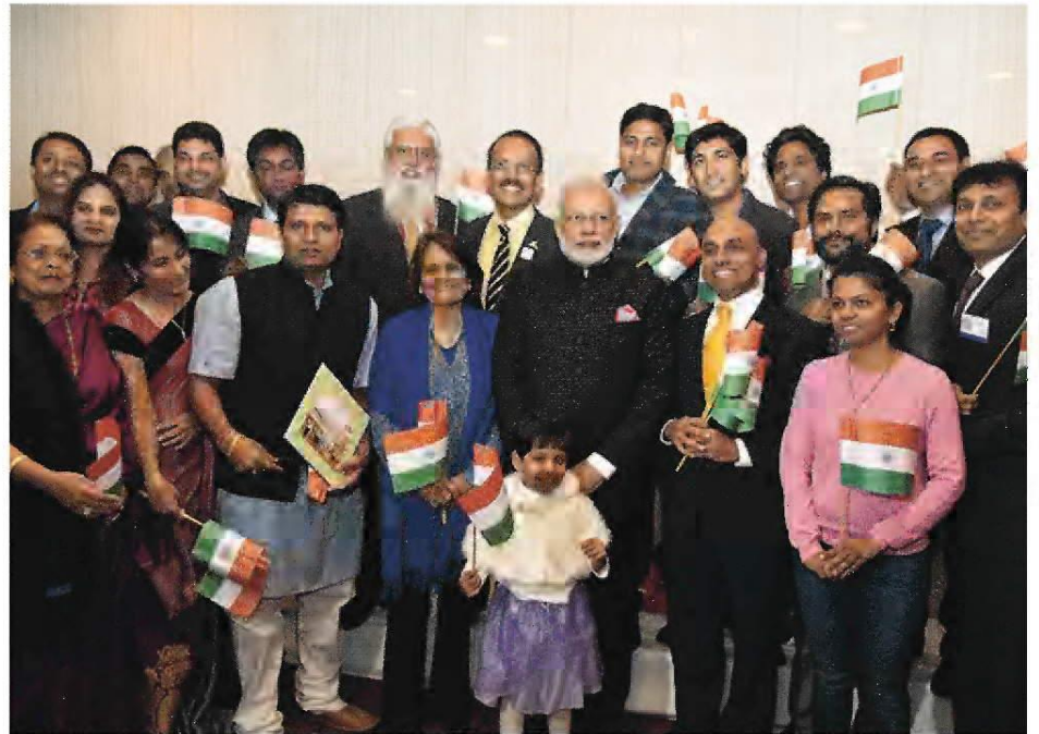
Prime Minister Narendra Modi, center right, is welcomed by the Indian community in Tokyo during his visit to Japan in November 2016.

I hope the 71st Independence Day of India will mark another milestone in our important relationship.