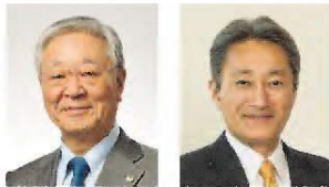
Hiroaki Nakanishi Kazuo Hirai

On behalf of Keidanren, we would like to offer our sincere congratulations to the people of India on the occasion of its 71st Independence Day. Japan and India enjoy a long-standing diplomatic relationship, and in recent times our two nations have built close, mutually beneficial relations through shuttle diplomacy between their state leaders. On the economic front, trade between two countries has been increasing steadily. Japanese investment in India has increased by more than 7.7-fold over the past 10 years and over 1,300 Japanese companies now do business in India. The business environment is improving, as exemplified by the historic introduction of the Goods and Services Tax under the