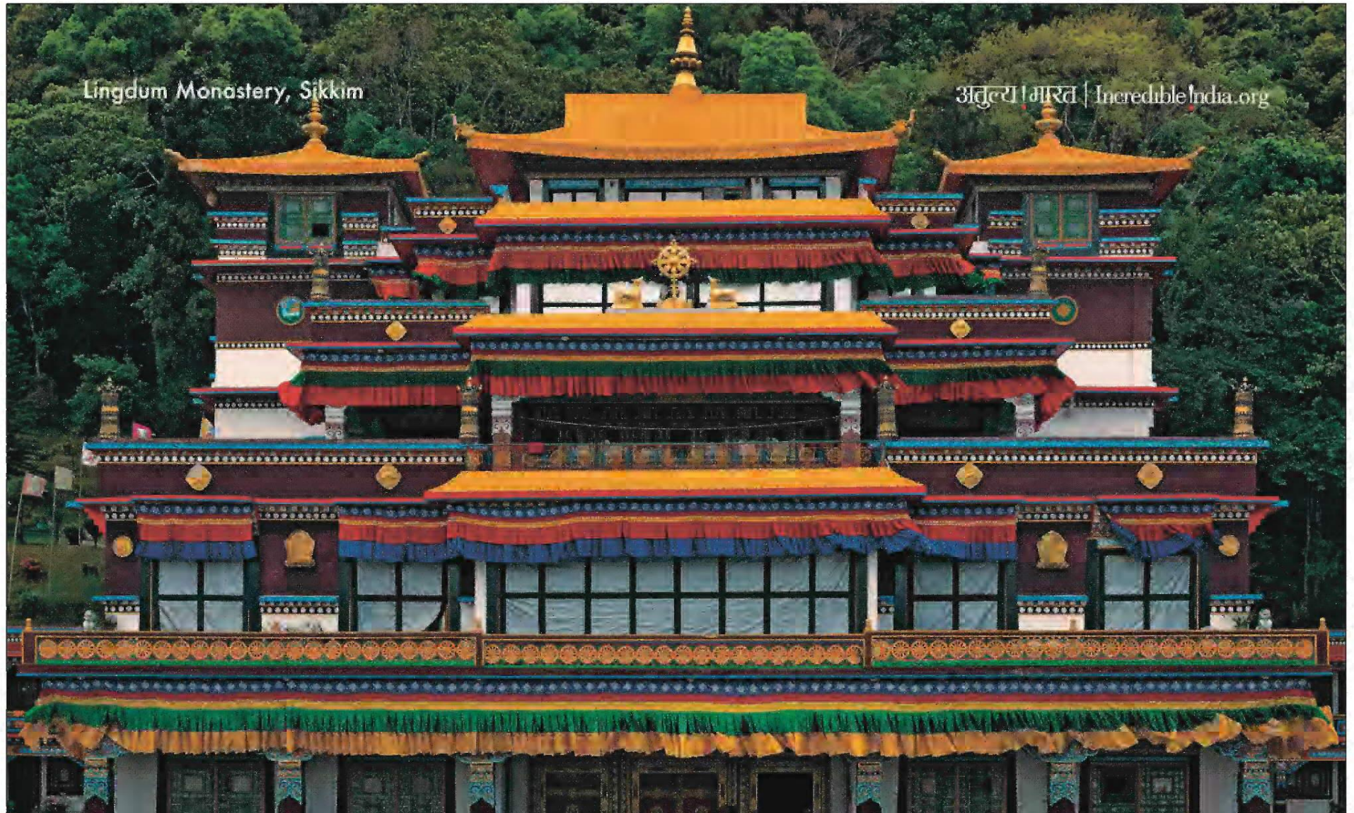
Lingdum Monastery, Sikkim

It is my privilege and honor to represent my country in Japan during such an exciting phase in our relations, and to engage the government of Japan, the Japanese people, the business community and academia on a broad range of issues. The India-Japan partnership promises to be a defining one in the 21st century.