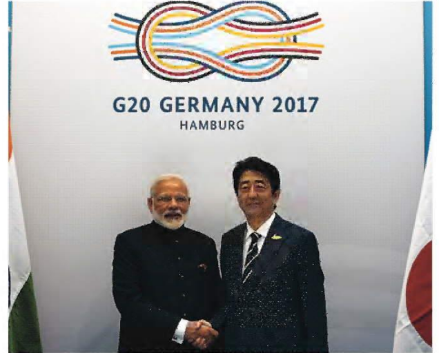
Prime Minister Narendra Modi, left, and his Japanese counterpart Shinzo Abe shake hands during the Group of 20 summit in Hamburg last month.

In a world of growing challenges and opportunities, the relationship between our two countries is a key factor in promoting stability in Asia and fostering a peaceful, multipolar world buttressed by increased connectivity and an inclusive, open and balanced regional architecture in the Indo-Pacific region. The recently concluded trilateral Malabar naval exercise held off the coast of India by India, Japan and the United States is a significant event in our maritime cooperation and renews our commitment to freedom of navigation in the seas. The Act East Policy of India complements the Enhanced Partnership for Quality Infra-